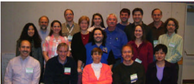
The pre-CHI'05 DevCon participants