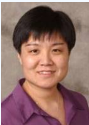
Editor-in-Chief: Ping Zhang (Syracuse U.)