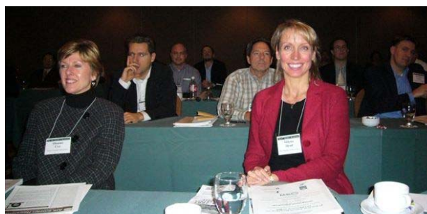
Workshop conclusion session audience