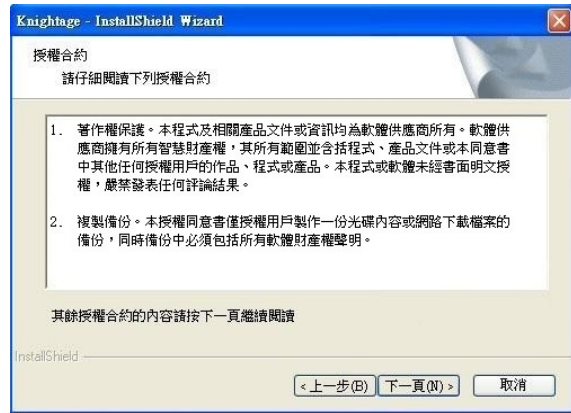
Figure 2. Force-read mode – an example picture