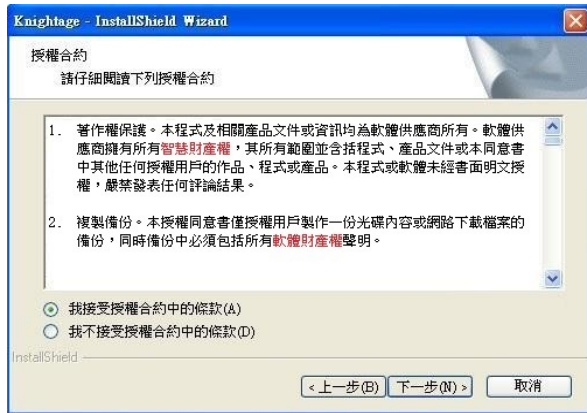
Figure 1. Keyword mode – an example picture