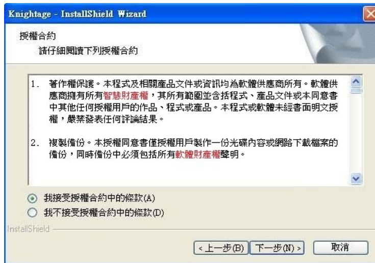
Figure 3. Analysis of AOI - an example in one picture