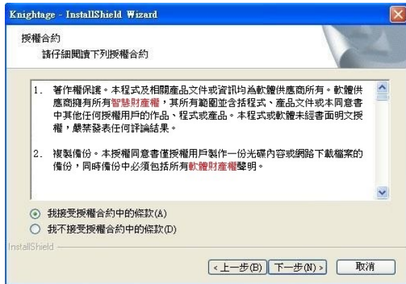
Figure 1. Keyword mode – an example picture